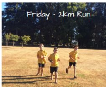
Friday - 2km Run