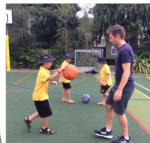
Wednesday - Basketball (skills and game)