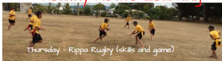
Thursday - Rippa Rugby (skills and game)