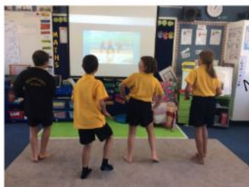
Monday - Jump Jarm Leaders' Training