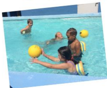
Monday - FlippaBall Training

During lunchtime, this term we are providing sports activities for students to get involved with. This might be because they are practicing their winter sport skills, they want to try a new sport, to spend time with friends or because they can't find another game to play. Our senior students are also helping with the practices.