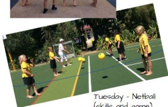
Tuesday - Netball (skills and game)