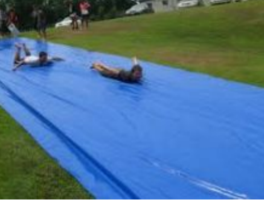
Thursday 4 February - First day of school 2021