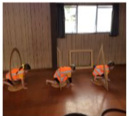
Crawling through the wooden shapes