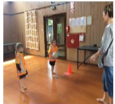
Throwing and catching a ball