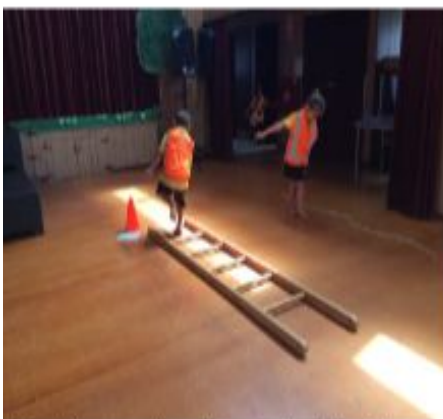
Marching and heel to toe beside the rope