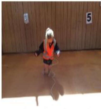
Jumping from side to side over the rope