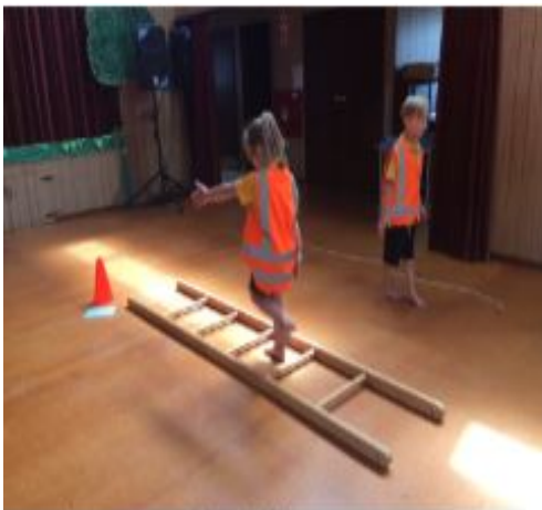
Marching over the ladder

PMP will take place three times/week in the Broadlands Community Hall with the Year 1 and some Year 2 students.