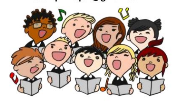
Taupo School of Music

Does your child love to sing? Our childrens choir is for students aged 6-14yrs old. It is cost free and audition free. A willingness to attend most rehearsals on Tuesday 5.30-6.15. Rehearsals start on Tuesday 23rd Feb. For more information please email the Principal on tsomprincipal@gmail.com