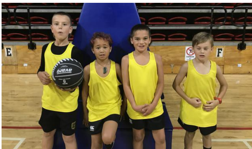
Healthy Active students in the Broadlands Basketball Teams