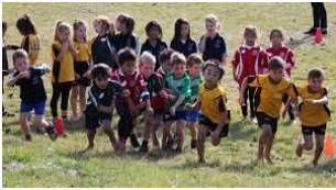
Cluster Cross Country

Hopefully you received the Facebook, email and/or SchoolApp alerts (one at the start; one at the end) in a timely manner from emergency HQ...aka Office!