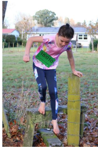
Healthy Active intermediate students participating at Broadlands Cross Country