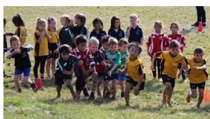
Cluster Cross Country

Our Cross Country team competed exceedingly well at Wednesday's Cluster Cross Country event held at the Lake Rerewhakaaitu Domain .