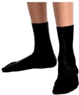
A good example!