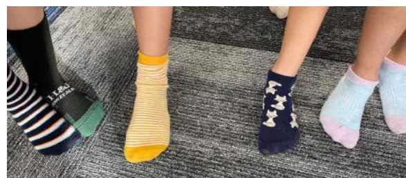
Not so good examples!

From Term 3, any non-regulation socks worn to school will need to come off!