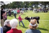
Calf and Pet Day - 'Heads Up' #4

Our annual Calf and Pet Day will be held on wednesday 20 October . (Week 1/Term 4)