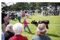
Calf and Pet Day - 'Heads Up' #6