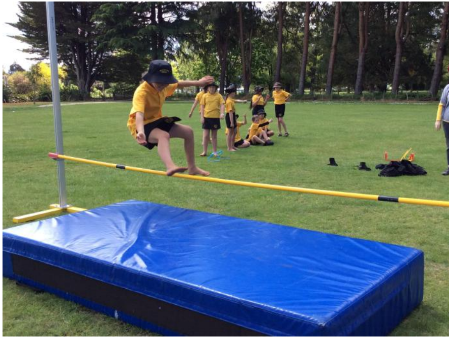
Healthy Active students practicing high jump