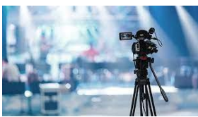
Prize Giving Livestream

Thank you for your anticipated support here.