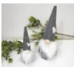
Room 3 had fun today making fabulous Christmas gnomes. They showed great creativity and listened to instructions very carefully!