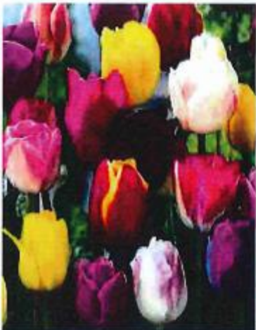
Tulips - Mixed