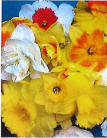
Daffodils - Mixed