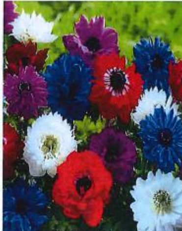
Anemone St Brigid (Doubles)