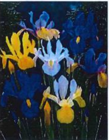
Dutch Iris - Mixed