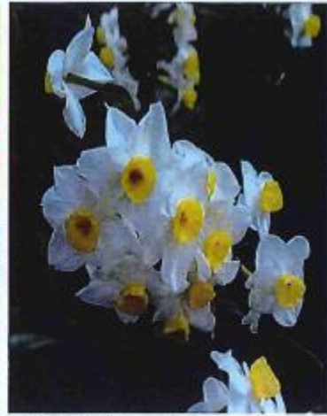
Daffodil - "Grand Monarch"