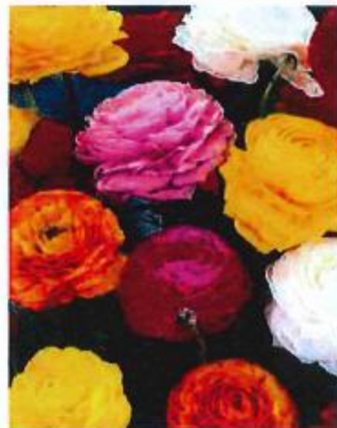
Ranunculus - Mixed