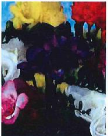
Freesias - Single and Double