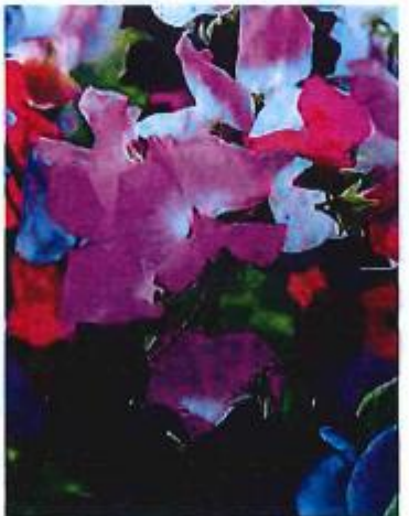
Sweet Pea - Early Multiflora