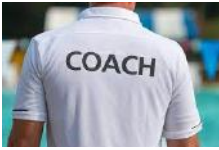
Our Coaching Team

6. Appointments to see your child's teacher about their learning can be made by email , phone , Seesaw or in person . For a quick chat, please just call in (before or after school is best).