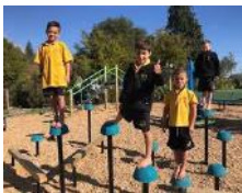
Broadlands School Uniform

Over the years, new uniform purchases have been charged out to you excluding GST, although Broadlands School was paying GST on the income.