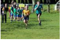
BOP Cross Country Championships

BOP Cross Country Championships age-group event to be held on Tuesday 28 June at Kaharoa School .