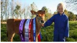
Calf & Pet Day

Your encouragement and support from home will be appreciated!