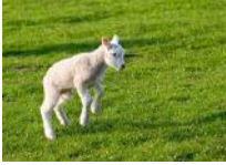
Calf & Pet Day Lamb