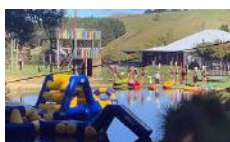
Year 5 & 6 Camp

There is a small number of second-hand and new sun hats for sale at the Office so please call in to view or to place an order ASAP.