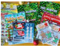
School Camp Raffle

An order form was sent out today for return and payment by Wednesday 26 October . $2.00 EACH.