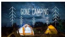
Year 5/6 Camp

Results will be announced next week as the certificates and trophies at a special assembly on Monday afternoon.