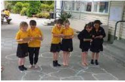
School Uniform Supply

We acknowledge that there are supply, sizing and product quality issues with the gold polo shirts involving the Bocini brand for which we apologise.