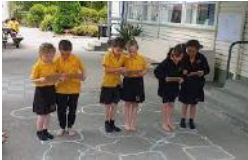
School Uniform Supply

We acknowledge that there are supply, sizing and product quality issues with the gold polo shirts involving the Bocini brand for which we apologise.