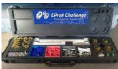
EPro8 Challenge Teams in Action

Our current balance is $802.00 . Once we have reached our $1,000.00 target we can redeem from a range of sports, technology, literacy, and music packages which will be hand delivered by your local Rural Sales Manager.