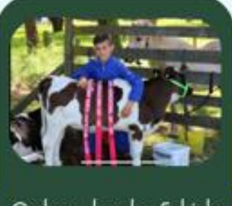
Calves, lambs 8 kids Junior, intermediate and senior, pre-schoolers welcome. Pets born between 30 July - 1 September