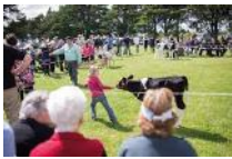
Calf and Pet Day - 'Heads Up' #3

Our annual Calf and Pet Day will be held on Tuesday 17 October . (Week 2 / Term 4)