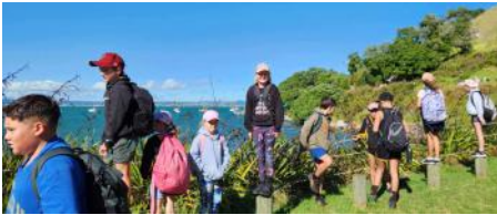
Papamoa / Mt. Maunganui Camp

Yesterday I had the pleasure of visiting our Year 5 & 6 students at the Waimarino Water Park near Bethlehem, Tauranga.